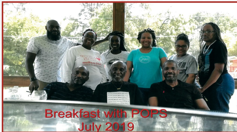
Breakfast with POPS July 2019