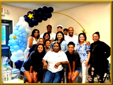
... "Does your momma look good in black because I do"